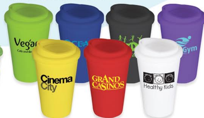
Mug without grip in a range of colours