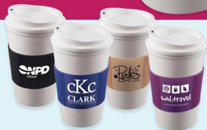
White mugs with coloured grips