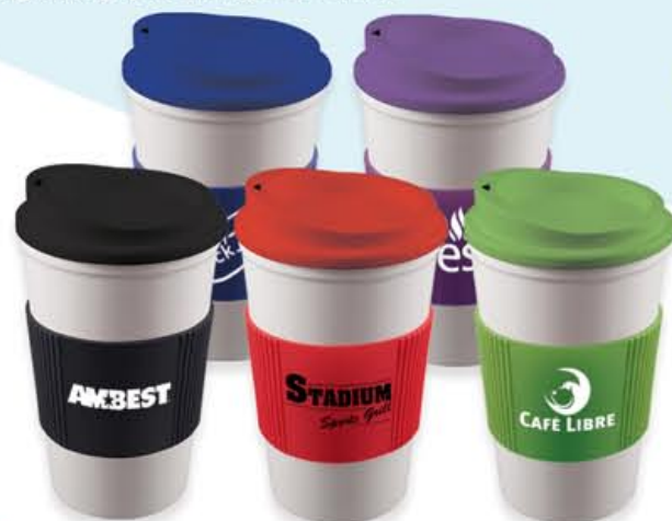
Mug with grip in a range of colours