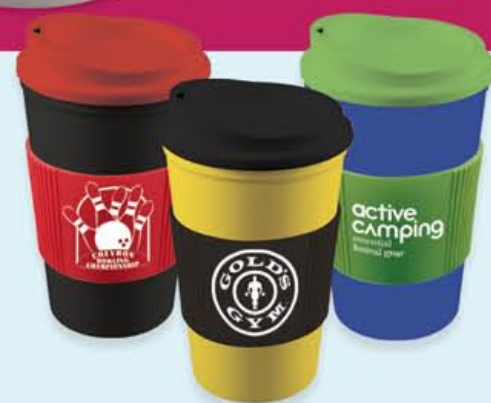
Mix and match mugs, lids and grips