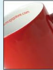
Inside Rim Print