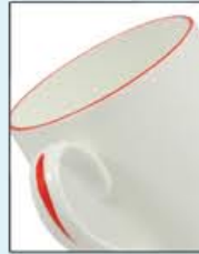
Banding & Handle Flash